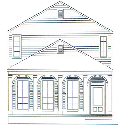
FRONT ELEVATION 3