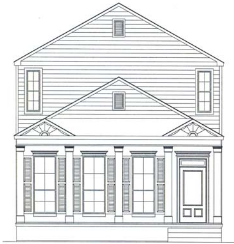
FRONT ELEVATION 4